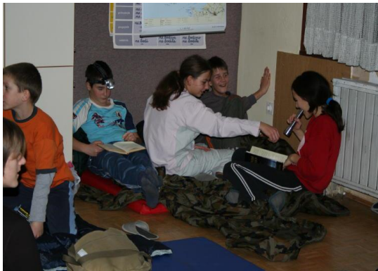
The Reading Night