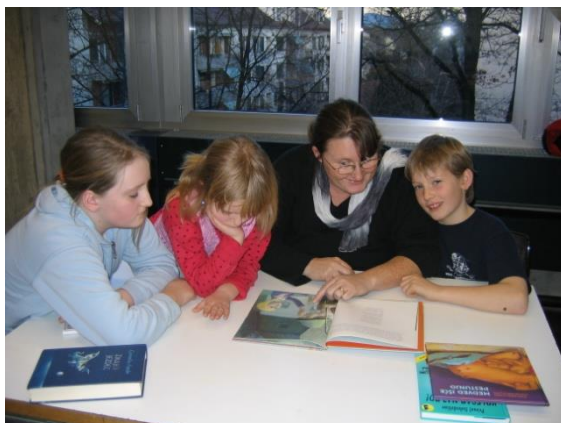
Family Reading (Schwitzerland 2008)